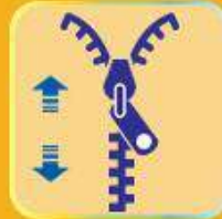
ZIP 5,000 CYCLES