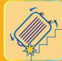
TUMBLE 50 CYCLES