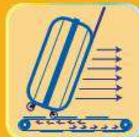
MILEAGE CYCLE TOTAL DISTANCE 24 KMS