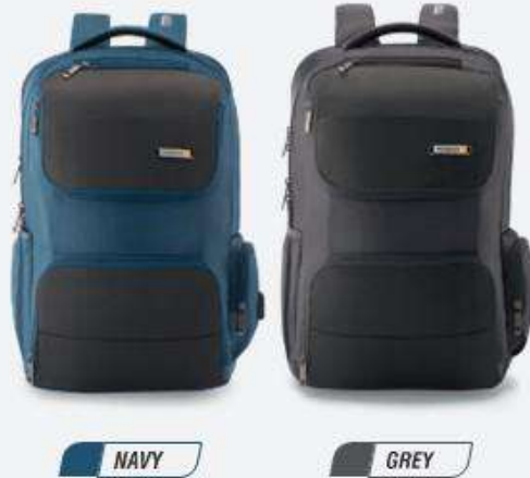
SEGNO VE 04 Expander