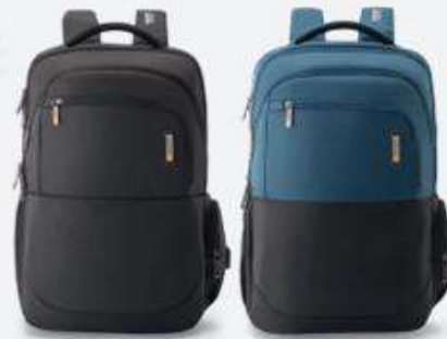
SEGNO VE 01