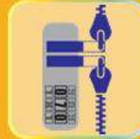
LOCK 1,5000 CYCLES