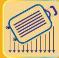
HEIGHT DROP CASE DROP HEIGHT 90CM