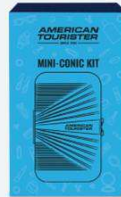
MINI-CONIC KIT PACKAGING BOX