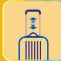
TROLLEY 1,000 CYCLES