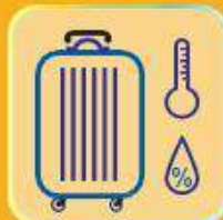
OVENAGE & HUMIDITY RESISTANCE KEPT IN CONTROLLED TEMPERATURE OF 65°C AND IN 98% RELATIVE HUMIDITY AT 38°C