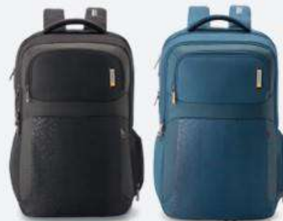
SEGNO VE 02 Detachable Laptop Sleeve