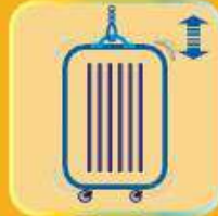
HANDLE JERK 2,000 CYCLES