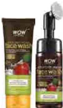
Apple Cider Vinegar Face Wash - 100 ml (Tube) - MRP ₹249 150 ml (Brush) - MRP ₹399