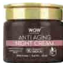
Anti Aging Night Cream- 50 ml - MRP ₹699