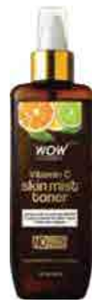
Vitamin C Skin Mist Toner 200 ml - MRP ₹399