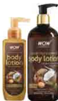
Coconut Milk & Argan Oil Body Lotion - 200 ml - MRP ₹275 400 ml - MRP ₹399