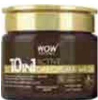
10 in 1 Active Miracle Day Cream- 50 ml - MRP ₹649