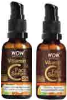
Vitamin C Face Serum - 30 ml - MRP ₹699(20%) 30 ml - MRP ₹899 (C+)