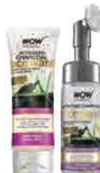
Activated Charcoal Face Wash - 100 ml (Tube) - MRP ₹249 150 ml (Brush) - MRP ₹399