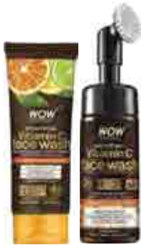
Brightening Vitamin C Face Wash - 100 ml (Tube) - MRP ₹249 150 ml (Brush) - MRP ₹399