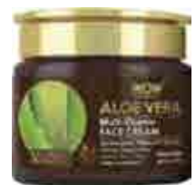
Aloe Vera Face Cream- 50 ml - MRP ₹599