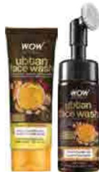
Ubtan Face Wash - 100 ml (Tube) - MRP ₹249 150 ml (Brush) - MRP ₹399