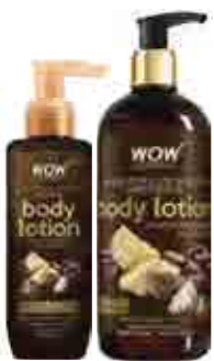
Shea Butter and Cocoa Butter Moisturizing Body Lotion - 200 ml - MRP ₹275 400 ml - MRP ₹399