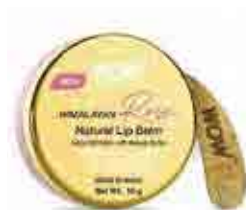
Himalayan Rose Lip Balm 10 g - MRP ₹299