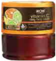
Vitamin C Clay Face Mask 200 ml - MRP ₹599