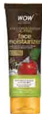
Apple Cider Vinegar Face Moisturizer 100 ml - MRP ₹349