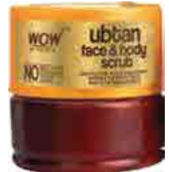
Ubtan Face & Body Scrub - 200 ml - MRP ₹399