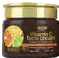
Vitamin C Face Cream- 50 ml - MRP ₹599