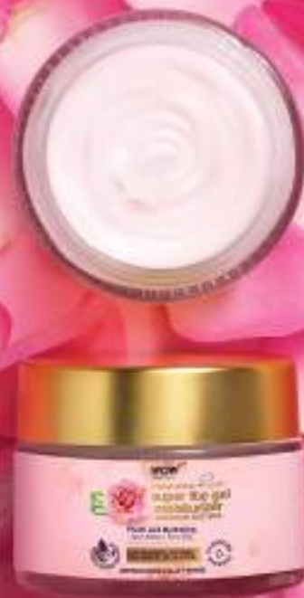
Rose Gel Moisturizer