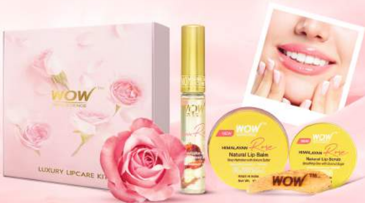
Lip Care Kit